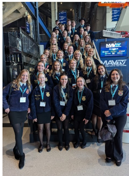
Marion Local FFA and New Bremen FFA at the FFA National Convention in Lucas Oil Stadium, Indianapolis.